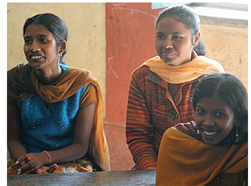
Some of the teachers are young enough to be students.